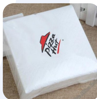
DUAL COLOUR PRINT