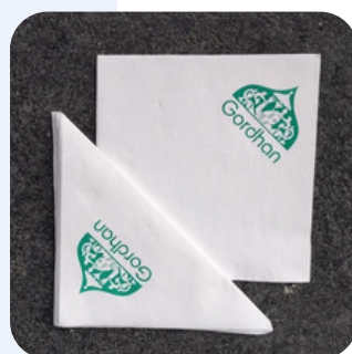
SINGLE COLOUR PRINT