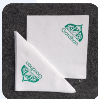
SINGLE COLOUR PRINT