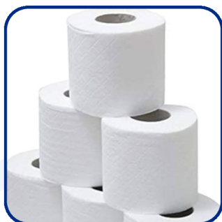
TOILET PAPER ROLL