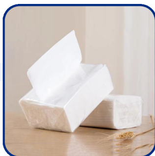
FACIAL TISSUE BOX